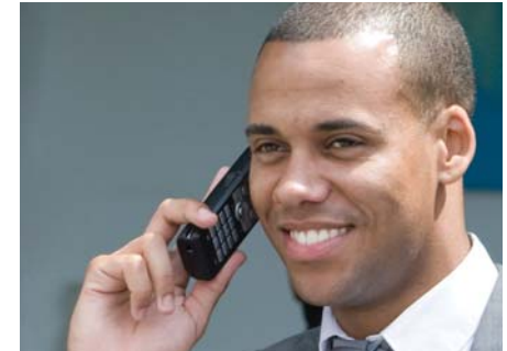
Freedom with DECT and mobile extensions