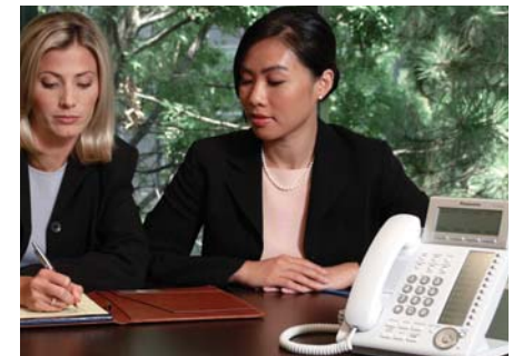
Conference with clarity