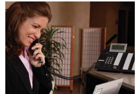
Advanced hotel functionality